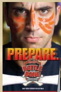
Posters (2) 24" x 36"

Prepare for profits with our ever-popular FRANK'S® REDHOT® wing-eating competition, now in its 7th year. Event rules and instruction guide included.