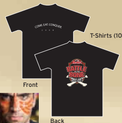
T-Shirts (10) Front Back Table Tents (20) 5" x 7"